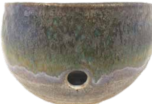
Artist: Sue Netka, Title: "The Bird Feeder" Ceramic