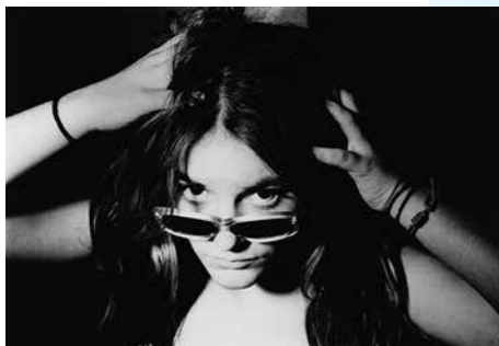
See back cover for credits