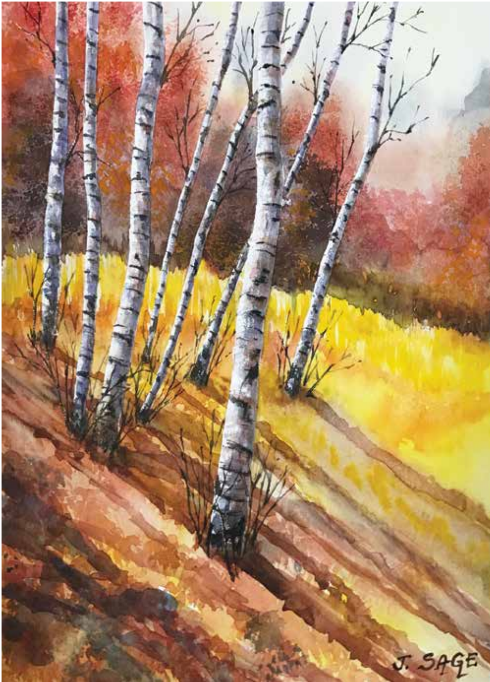
Artist: Jefferson Sage, Title: "Autumnal #6" Watercolor